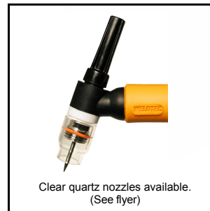
Clear quartz nozzles available. (See flyer)